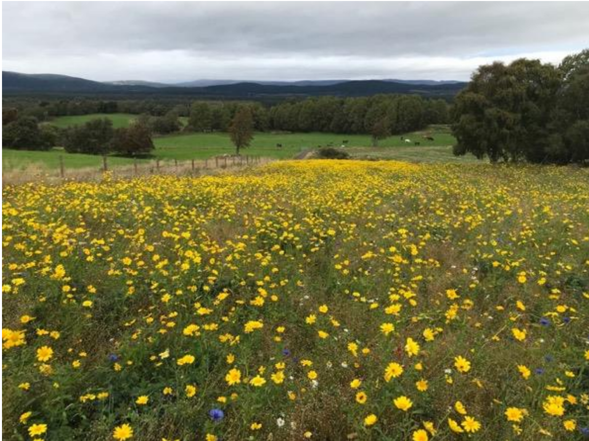
Easter Tulloch on 14 th September

The second field at Easter Tulloch was also sown on May 17 th with a mix of corn annuals, bird seeds and black oats. It too got rather swamped by weeds due to the prolonged cool wet June and early July, however, it recovered well when the weather warmed up and was looking great on 24 th August when this picture was taken.