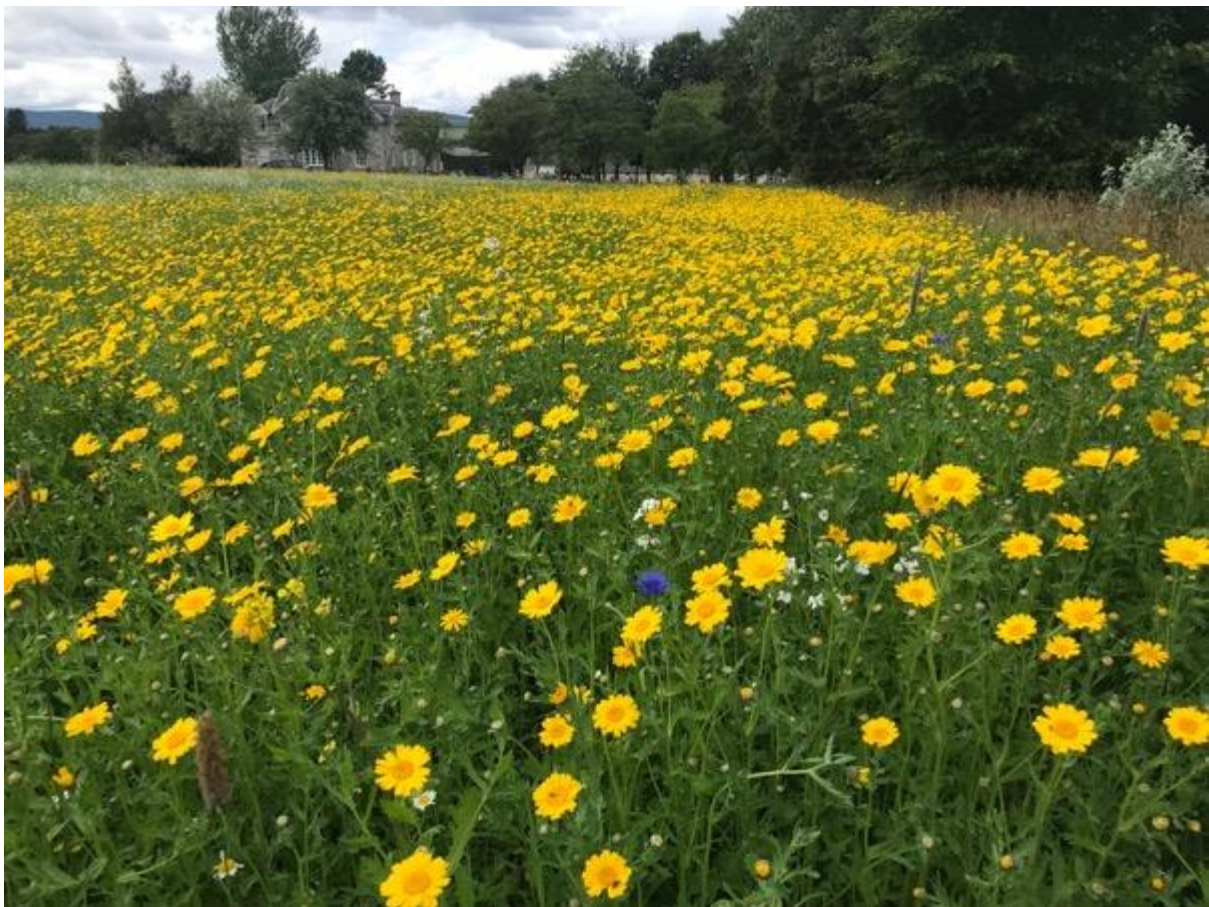
Balliemore on 26 th July

Again, you can see how the yellow corn marigolds have become well established and rather dominant.