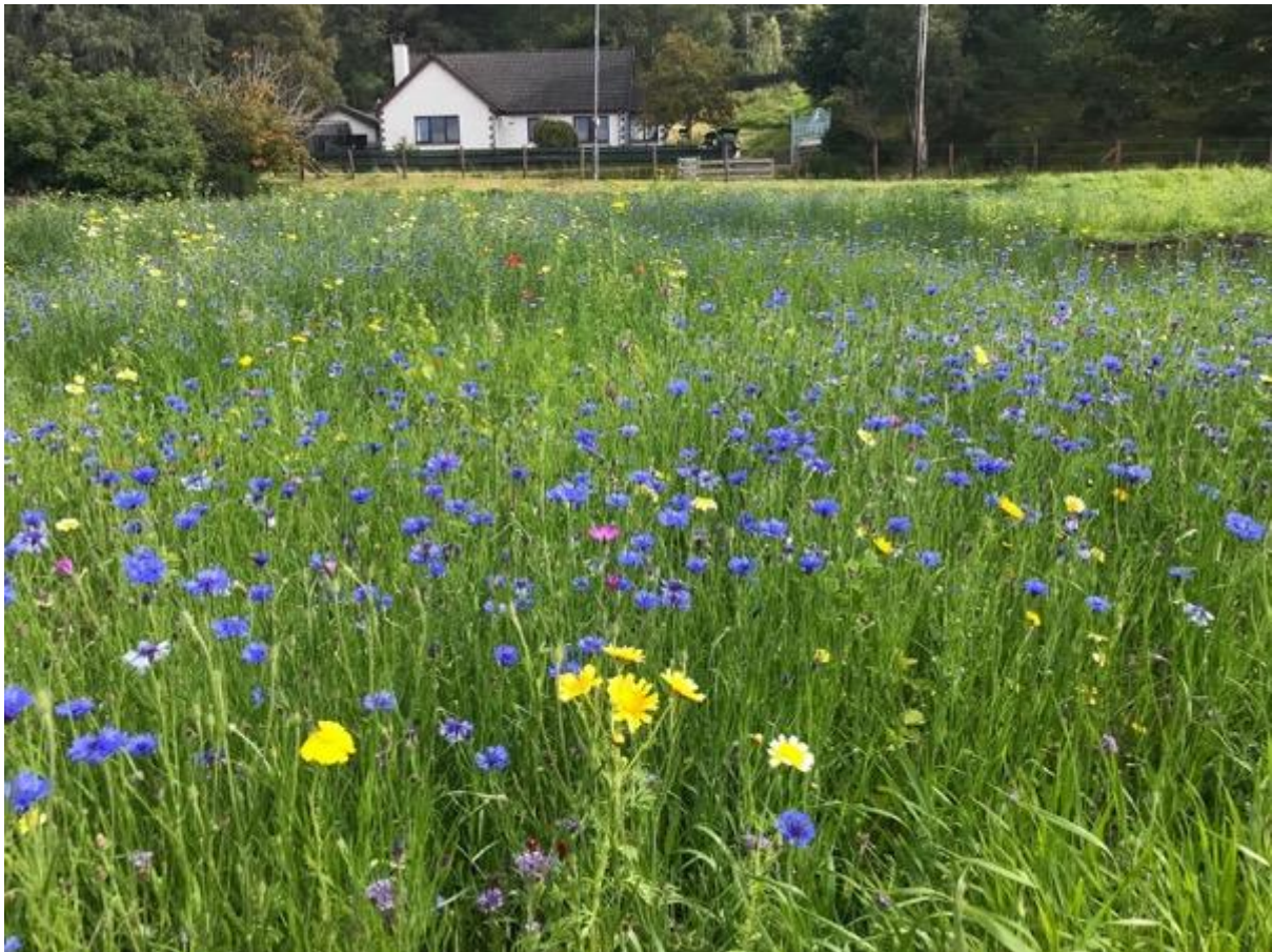
Broomhill Court 18 September 2024

This new area in Nethy bridge was sown with a mixture of cornfield annuals and a perennial flower and grass mix. We will be monitoring the Perennial mix in subsequent years and local residents are actively managing the site.