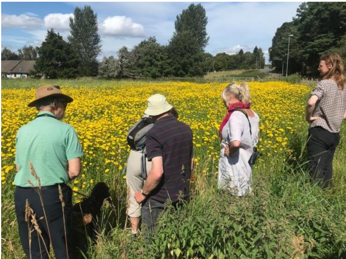
Delegates admire Mousa during our open afternoon on August 14 th

We will review this field for next year as there clearly has been a build-up of yellow corn marigolds which rather dominate other flowers. We will endeavour to have a greater range of colours in this field which is so close to the village.