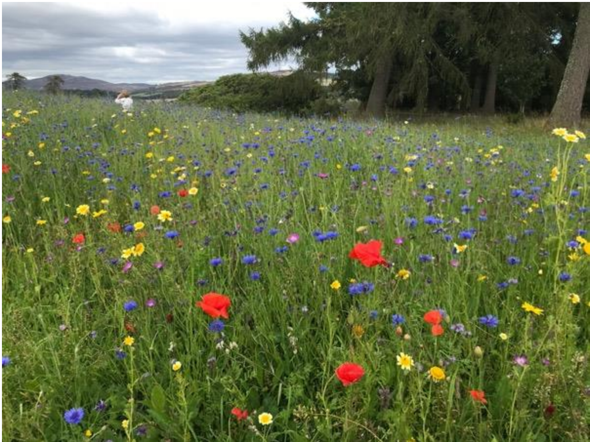
Aileen in one of the flower patches at Clury on 17 th September

The bird seed patch flourished well during August but it was not till the heat came in September that the flower sites were at their best.