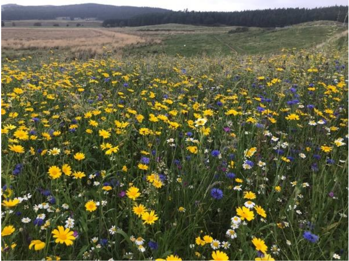
One of the Balliefurth annual flower meadows on 9 th September