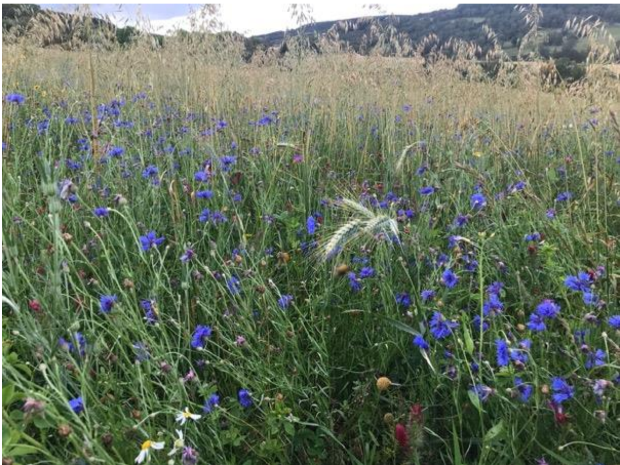
Balliemullich on 25 th September

On 2 nd January a lovely charm of 25 goldfinches along with some yellow hammers and chaffinches were feeding on the flower heads. We perhaps sowed too many black oats as they rather swamped the flowers.