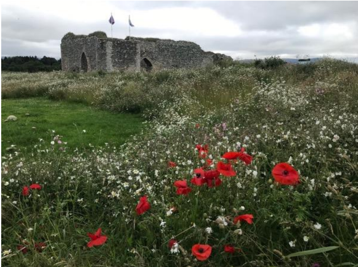
Castle Roy on 14 th July

The meadow area at Castle Roy flowered well with a good variety of Perennial wildflowers including Pink and White Campion, Yarrow, Wild Carrot and Oxeye Daisy. The established meadow was cut in September. The Motte surrounding the castle was also cut and the arisings removed. In October a work party of volunteers scraped patches on the Motte to sow yellow rattle and small sections of wildflower seed. In March 2024 a wildlife hedge of 100metres was planted with 10 different native species. Our thanks to excellent local contractors who prepared and planted the site and erected fencing to prevent damage by hares. The wet spring and summer helped the establishment of the young shrubs.