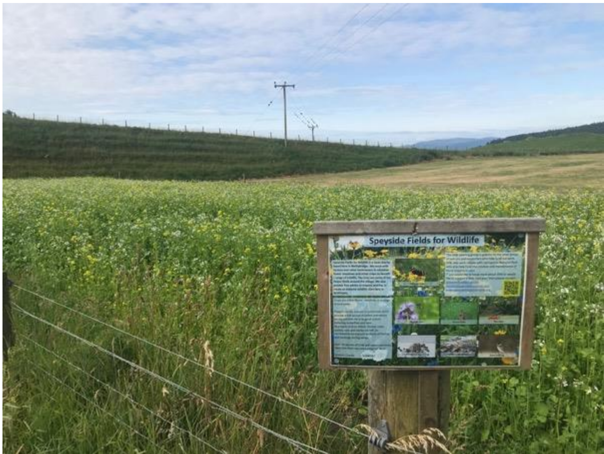
The wild bird seed crop at Balliefurth on 24 July

These sites are particularly valuable as they are adjacent to the Speyside Way and can be enjoyed by walkers and cyclists as well as wildlife.