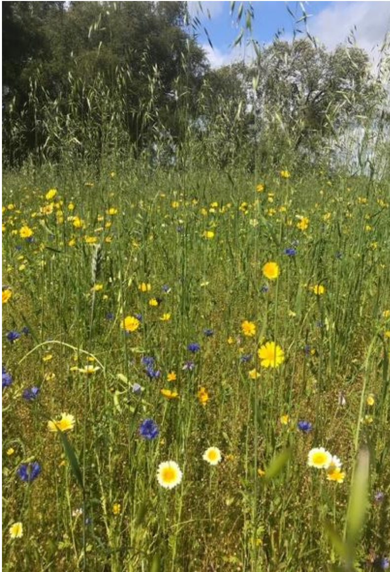
The small field at Easter Tulloch. A good show of corn annuals, black oats and wild bird seeds. Photo: 24 th August. This field flowered well into October.