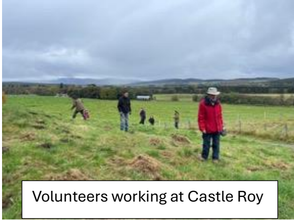
Volunteers working at Castle Roy