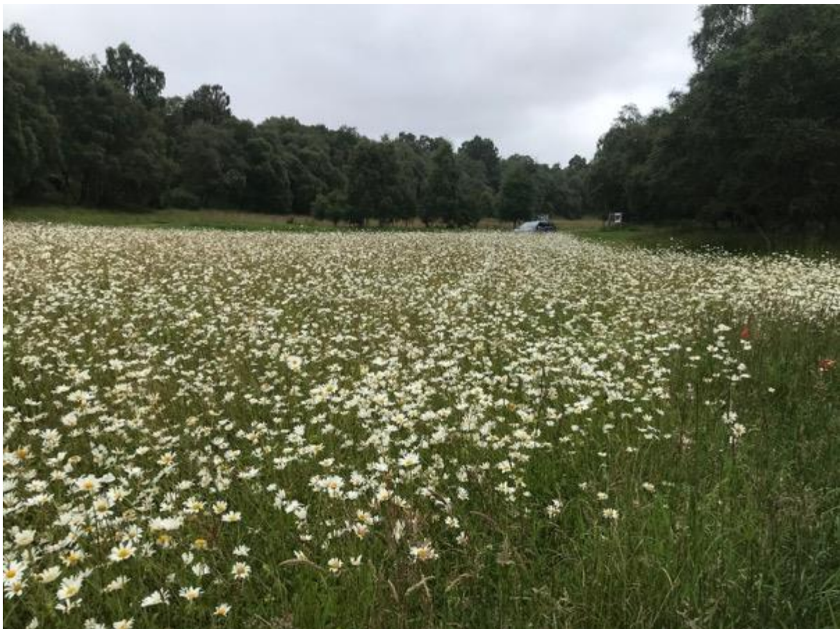
Dellifure meadow on 14 th July.....

Gerald Calder mowed the meadow in September and removed the toppings. Let's see how it develops over the coming seasons.